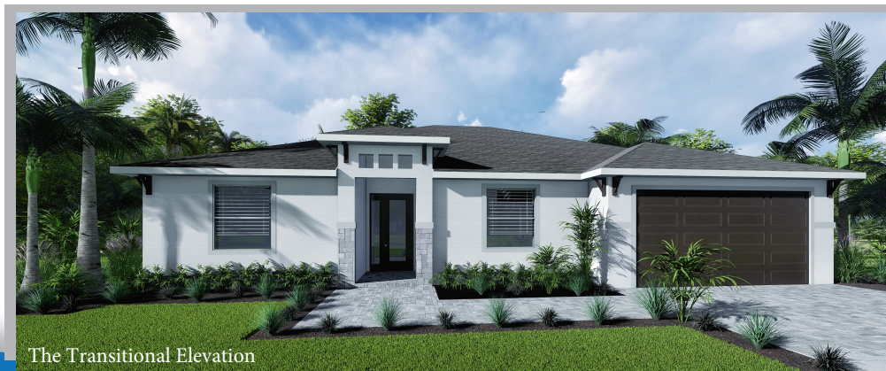
The Transitional Elevation