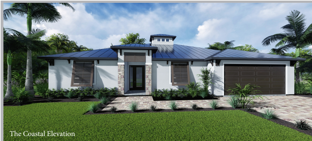
The Coastal Elevation