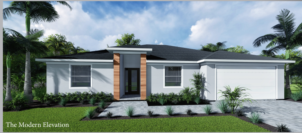
The Modern Elevation