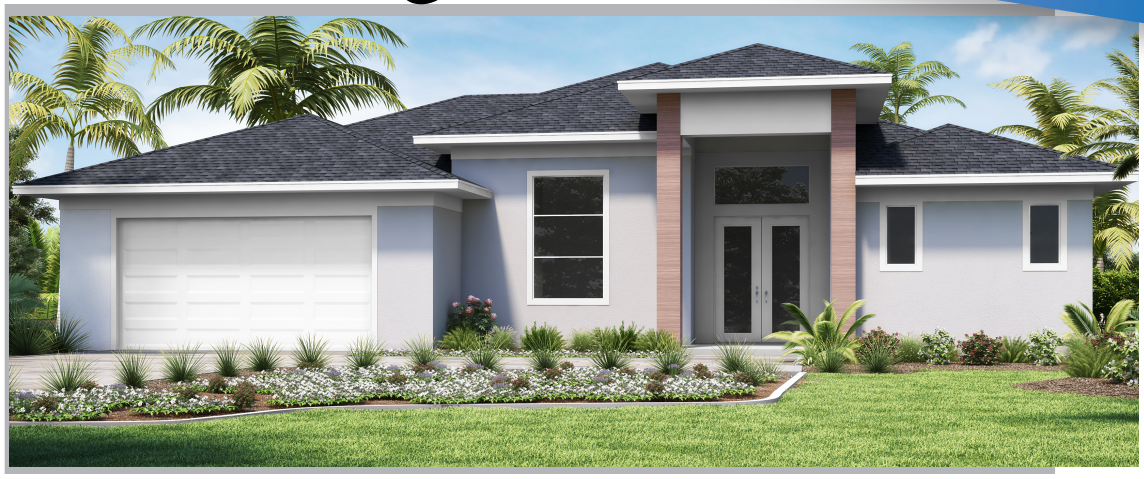
The Modern Elevation