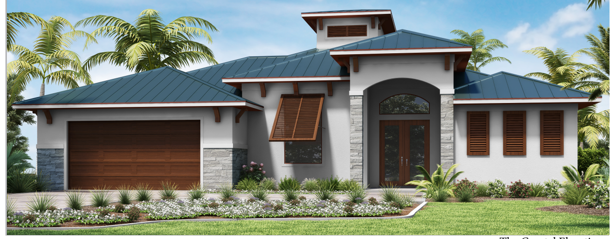
The Coastal Elevation